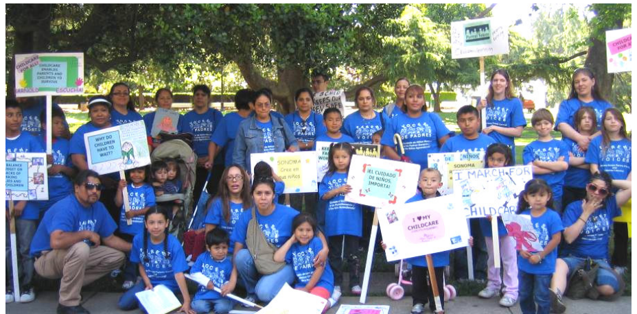
Sonoma County Parents at Stand for Children Day in Sacramento, May 2010

Parent Voices of Sonoma , a parent led grassroots group that has grown to 125 members is hosted by 4Cs. Parent Voices actively engages, informs and involves parents in developing leadership skills and advocating on behalf of children having access to quality, affordable preschool and child care. The California state budget crisis has been a call to action for parents across the state, who have been sharing their personal stories about the importance of quality affordable preschool and child care with state lawmakers.